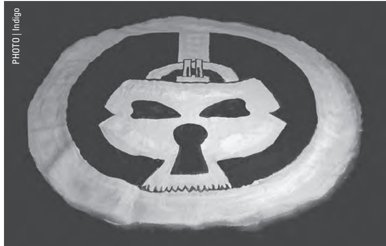
Saguaro Man’s missing and irreplaceable Gate Department flag.

No mention of the missing flags was made in the Saguaro Man AfterBurn Report. 🐷