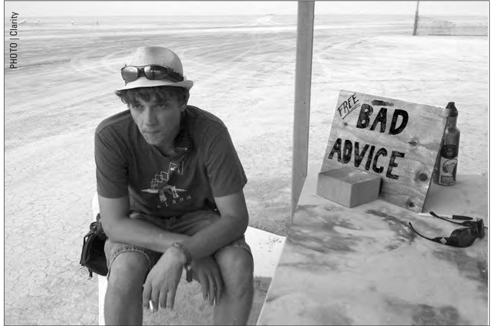
Can you find Zero, a member of the Gate, Perimeter, and Exodus Department?