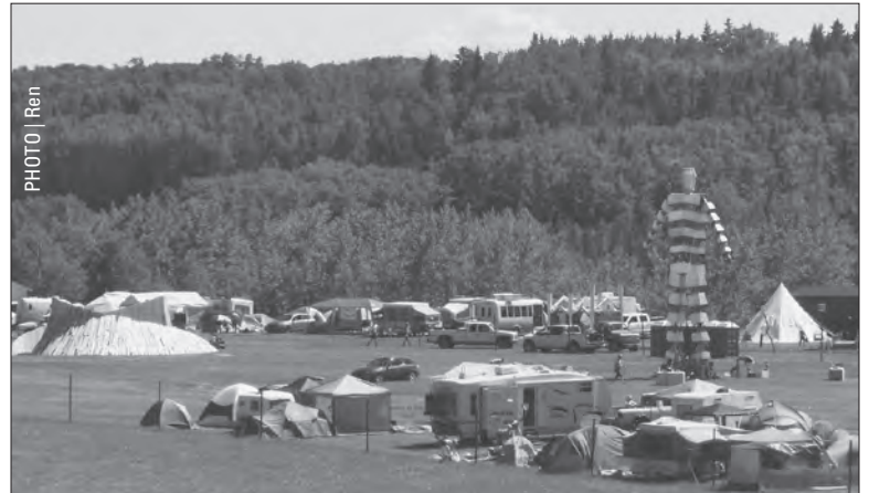
500 Burners celebrated the solstice at this year’s Freezer Burn, the regional event for Alberta, Canada.