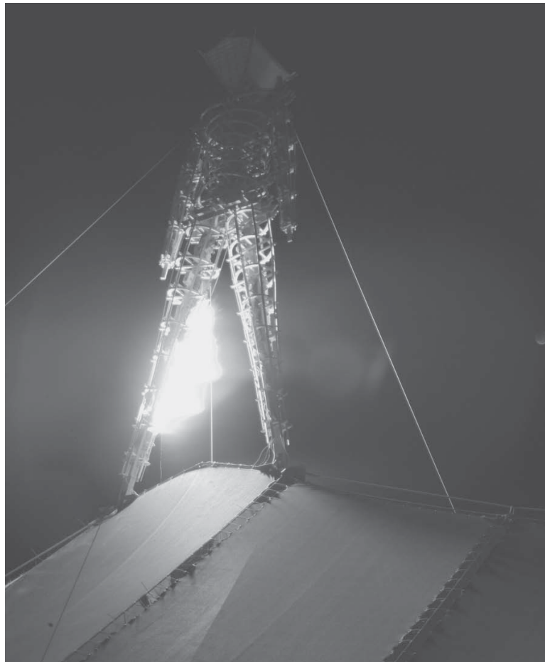
The Man burns early.