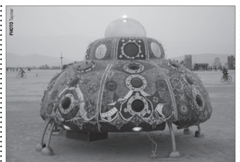
UFOs were a popular theme this year.

Law enforcement also reports that several Burners were ejected from the event on Friday for issues that took place earlier in the week. 🖚