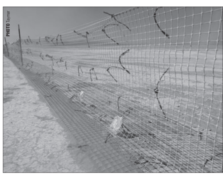
The trash fence's unique design prevents items such as plastic bags from exiting BRC

The Beacon asked Ember, the creator of the trash fence, how this compares to the first pile of MOOP collected in 1996. The original trash fence was just one mile long, he said, placed to catch items sailing downwind from BRC. The morning after he set up the fence he went to see what it had trapped. The items he remembers are: one dollar bill, one counterfeit dollar bill, a baggie of vegetable matter, some beach balls, and a dust jacket from the classic medical tome Gray's Anatomy.