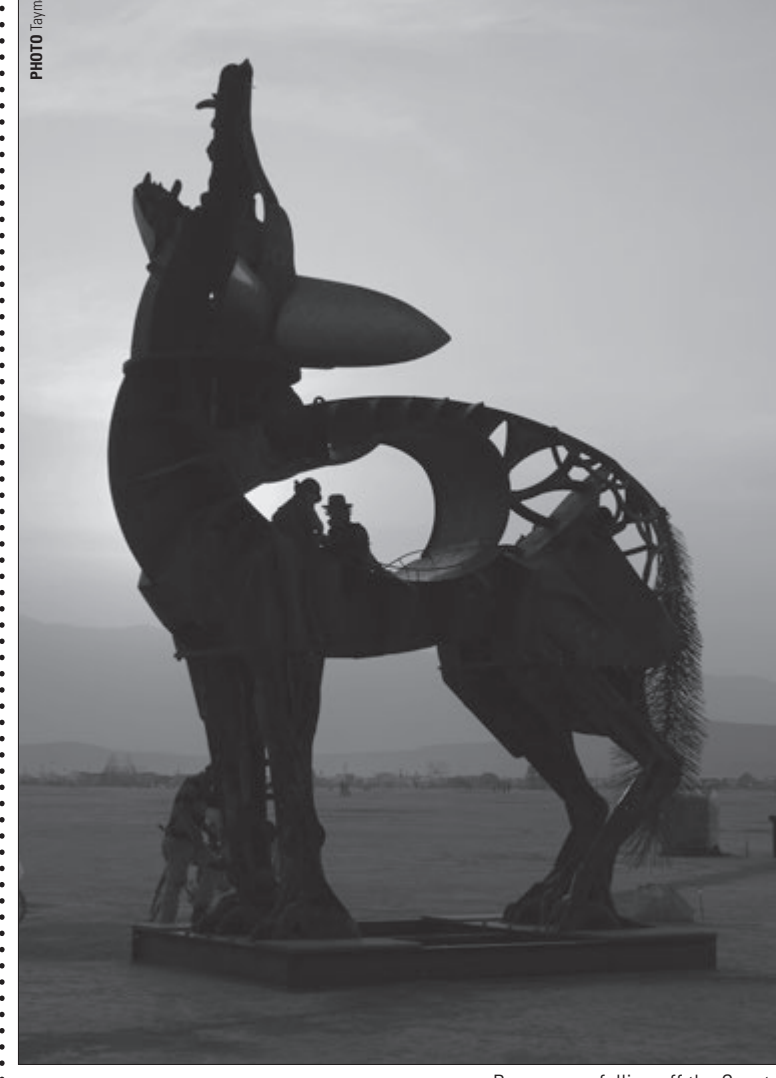
Burners are falling off the Coyote.

This is not the first time that weapons have been confiscated at Burning Man. The BLM representative said that every year there are weapons confiscated at Gate, but generally those weapons are swords or other items used as part of a costume.