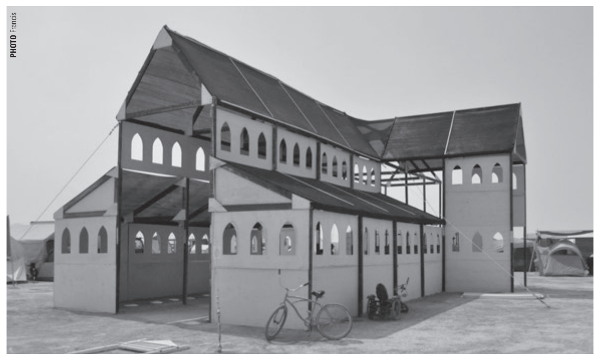
The Jerk Church cathedral, based on Gothic archtecture, is hosting several burner weddings this year. It is impressively large, measuring approximately 20' tall, 53' long and 30' wide.