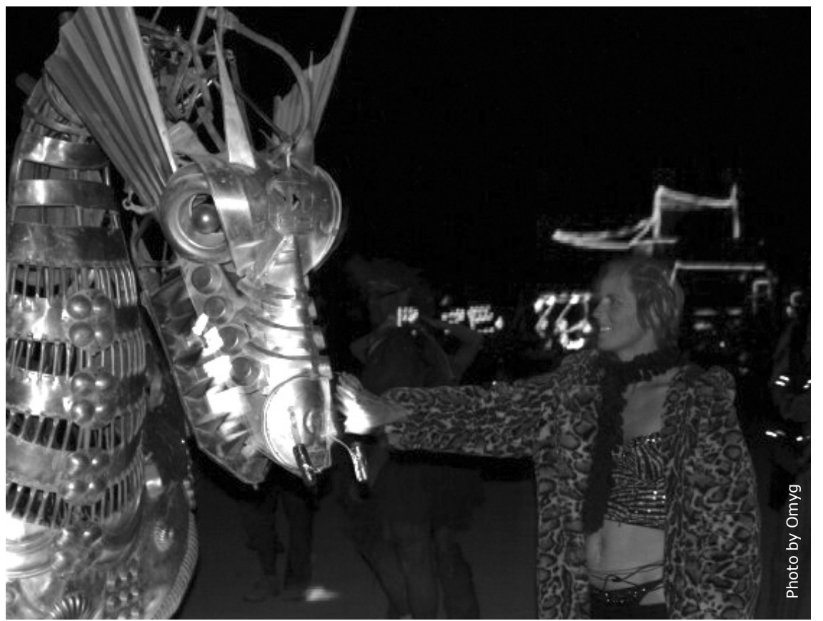
The Production Department's favorite playa sculpture so far.

Schedules are posted at each bus stop, marked by the red Nowhere Omnibus signs. 🐰