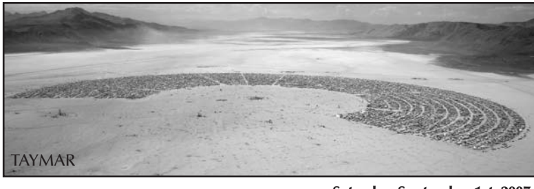
Saturday, September 1st, 2007.

limit. Not the capacity of the Playa, which could accomodate hundreds of thousands, but the two-lane road that almost 67 hours.