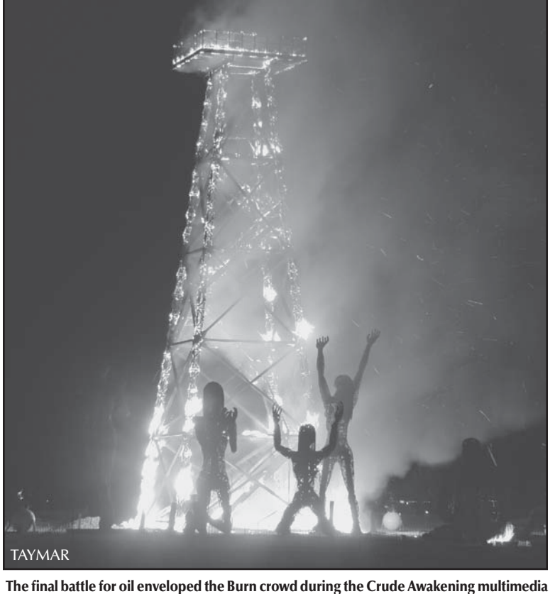
performance. Gun powder, fire cannon, fireworks, smoke all in surround sound!

There's no way to see all the events at Burning Man, but if you walk down the street, who knows what or who you will find? Just ride the river, and the one thing you will find are new friends at every turn.