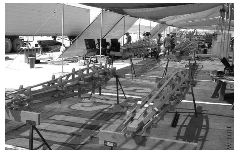
Wednesday afternoon, in the woodshop under where the man reposes. Department of Public Works is speed manufacturing a new man. Legs, arms and torso are well along to completion. Only a face piece with some charred wood and melted neon tubing is being reused.

Mystique said, "The heat sometimes, but it's kind of fun sometimes because you get the spritzers--you don't get any of those at home, unless it's Windex or