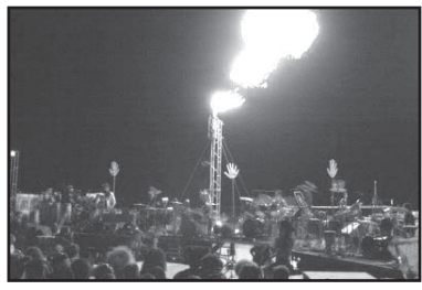
MUTAYTOR, BLACK ROCK CITY, 2004 up pleading no-contest to charges of "attempted lewd acts with a minor." He received probation, counseling and community service.