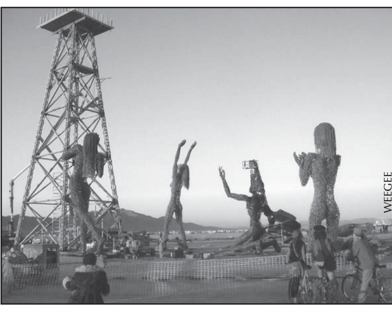
CRUDE AWAKENING, SITE OF MUTAYTOR'S NEXT BIG THING

down at his home after he failed to show up to meet a fictitious minor.