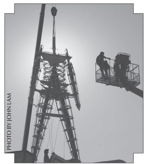
HERE TODAY. GONE TOMORROW.

Those who see Burning Man only as a weeklong vacation may be missing the opportunity to influence our future history. In 40 years, Burning Man will likely have evolved, its story codified as a